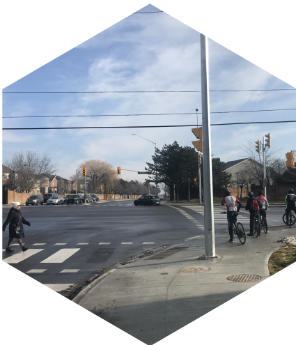
signalized & stop-controlled intersection improvements