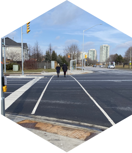
pedestrian & accessibility improvements