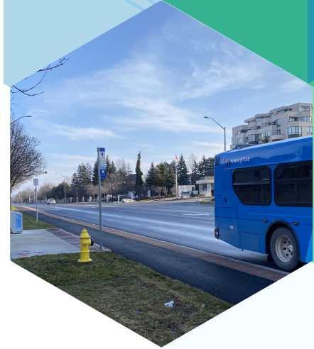
new bus rapid transit stops & upgrades