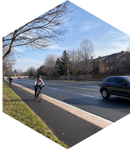
in-boulevard cycling facilities