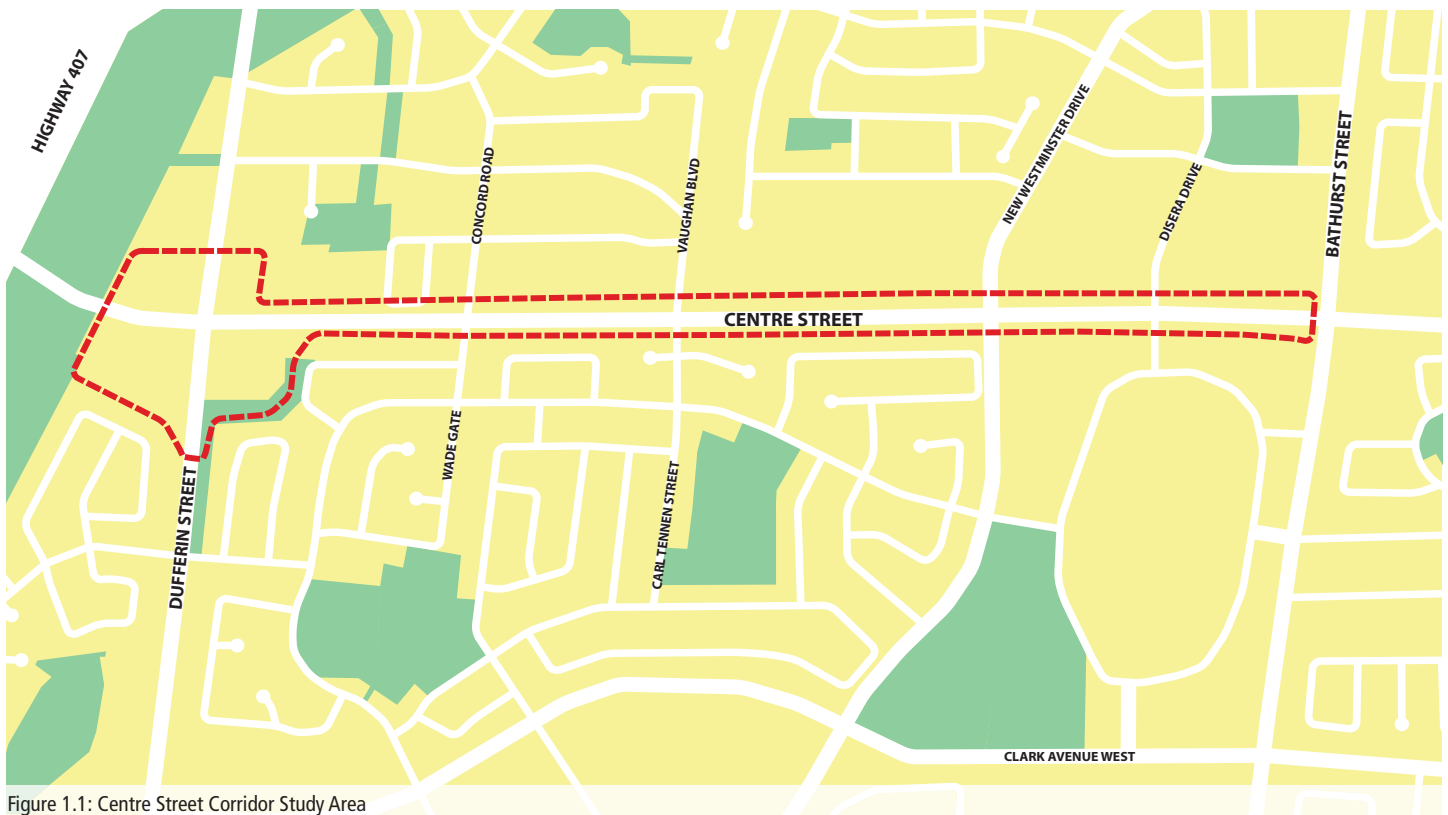
Figure 1.1: Centre Street Corridor Study Area