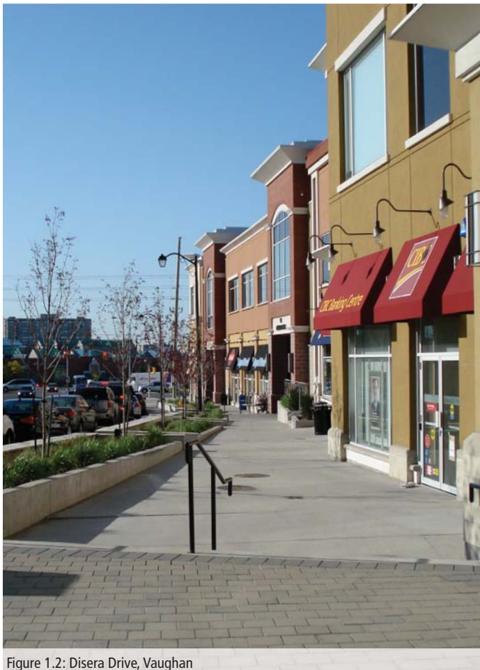
Figure 1.2: Disera Drive, Vaughan

The vision for the Centre Street corridor is to establish a primary destination to live, work and play for the residents of Vaughan and beyond. Through the development of a set of design typologies and standards, the transition from a main transportation corridor to a destination corridor is achievable.